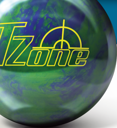
Blue/Green Solid Glow